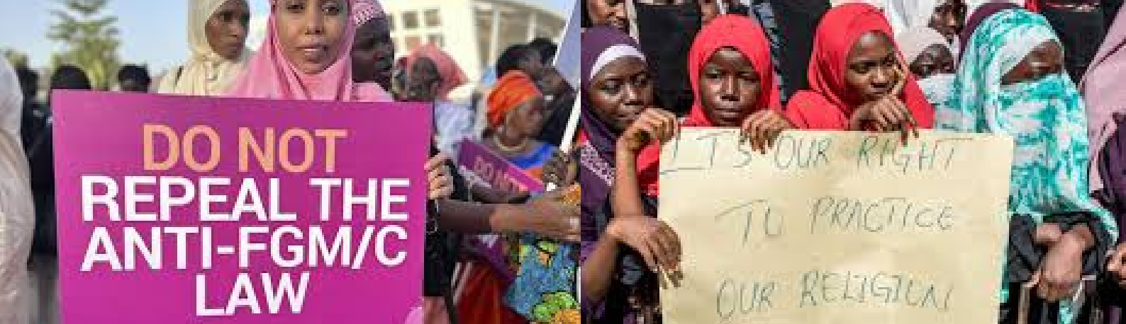
Different views expressed outside of parliament as they debate repealing the ban on FGM